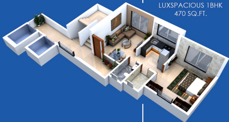
LUXSPACIOUS 1BHK 470 SQ.FT.