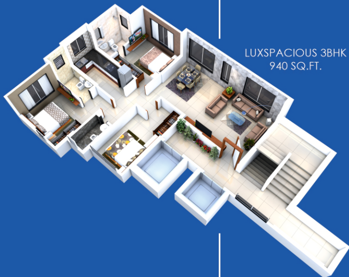
LUXSPACIOUS 3BHK 940 SQ.FT.